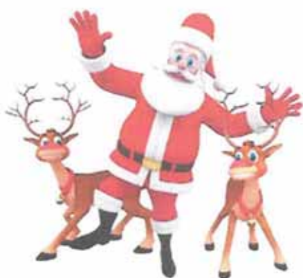
Santa Before Lessons