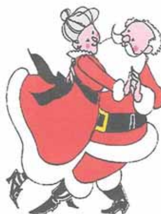
Santa After Lessons