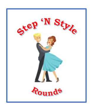
Step 'N Style