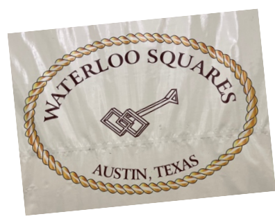
Waterloos By Sue Gillar